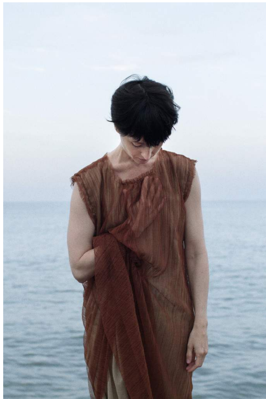
She enjoys playing with her clothes